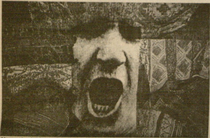
Unmasked #2, serigraph by Jim Kraft

PRINT STOP: If you haven't taken the time to look over in The Prints of Albuquerque , you're either a fool or you just hate this town. This month-long, citywide tribute to local printmakers—on display now in both private and public galleries all around town—has turned out to be quite an impressive exhibition of what our city has to offer. So if you are interested in checking it out and don't know where to begin, might I suggest Anything But Ordinary . A group show hosted by Unified Arts Company, an accomplished local print shop, Anything knifes along the margins of the genre, featuring prints that challenge traditional notions of static color and composition—ultimately fric- asseeing the ways in which we look at, think of and approach printed artwork. On second thought, maybe this isn't the best show to start your tour of The Prints of Albuquerque . But it promises to be one of your more memorable visits.