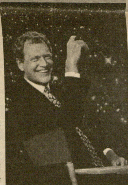
Yeah, I'm a jerk, but that's why you love me

STUPID YOU: Let's face it. You'll never get rich and famous. Certainly not as rich or as famous as David Letterman, the once-funny, long-running doyen of late night television. So the way I see it, your best shot at show biz success is just to make an utter fool of yourself and hope that people fall for it. If this sounds like a sound strategy to you, then you might want to sign up for the Albuquerque auditions for Dave's Late Show , coming up this weekend. Perhaps the only remotely entertaining thing on CBS, the Late Show is looking for people—and their pets—to pad the show's dubious "Stupid Pet Tricks" and "Stupid Human Tricks" segments. All they ask is that you and/or your animal companion be "fun, unique and safe"—i.e., no seals on beach balls or high-diving mules, and don't do anything to your body that you wouldn't want 10 million people to see. Now go out there and make us proud!