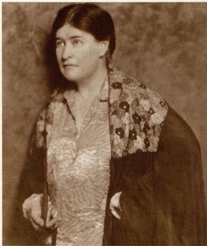
46 Willa Cather, author of Death Comes for the Archbishop.